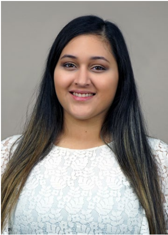
Scholar Medical Business Office Professional